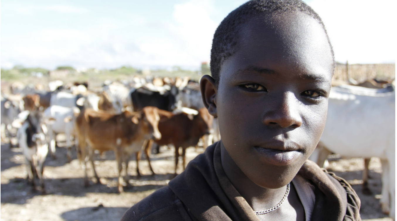
Samburu County, Kenya.

Africa is a huge continent. It is larger than Europe, North or South America. It is home to many different countries and hundreds of different groups of people.